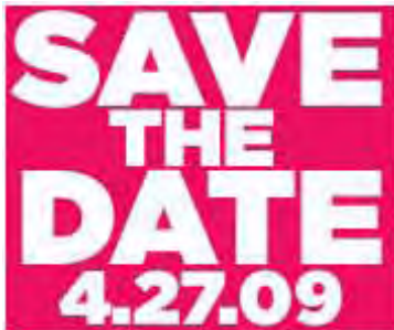
Sample Home Page Button

BUTTON #1 - (150h x 180w): Right-hand column above the fold Price: $250 per month